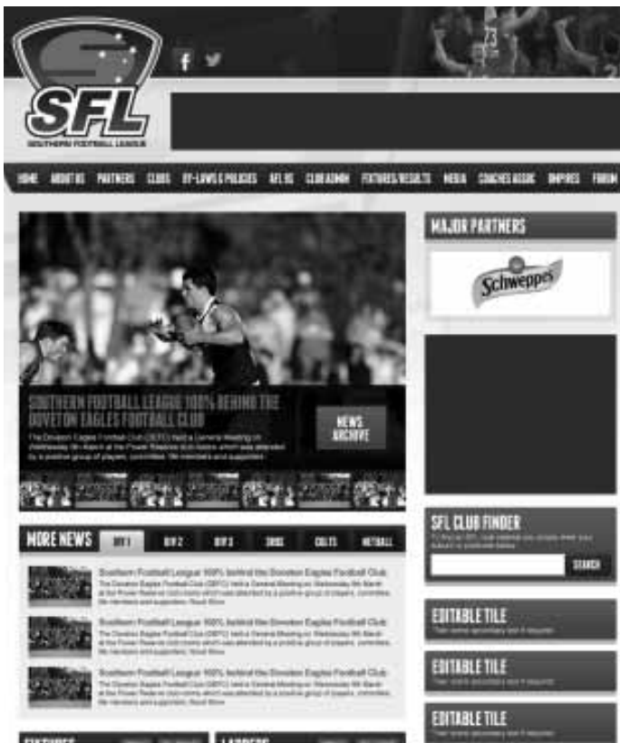
A rough design concept of the new SFL website.