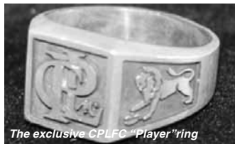
The exclusive CPLFC "Player" ring

Paul Mauracher can be contacted on 0432 407 650 for further information.