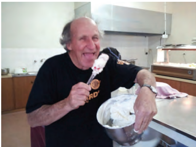
Chief Stirrer & Taste Tester!