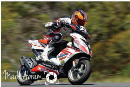
Youngest Team - TNT Racing

WITHOUT doubt far exceeding the first thought expectations of its likely success, last Saturday's six hour scooter race at McNamara Park proved to have a most popular outcome with a remarkable entry of riders from many parts including Tasmania