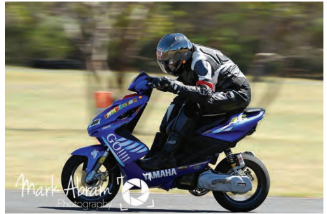
Group B Winners - Team Von-Ellis