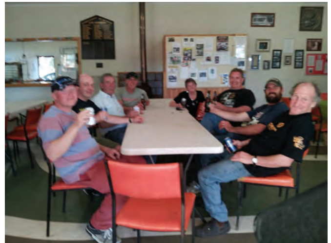
The Kitchen Crew (who said this is hard work?)