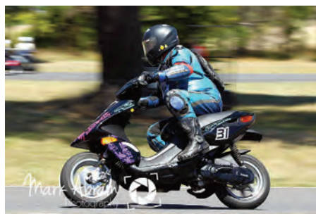
Oldest Team - The Rusty Nuts Seniors