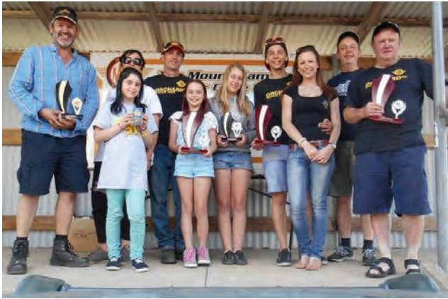
Group A Winners - Team Orchard Road

WITHOUT doubt far exceeding the first thought expectations of its likely success, last Saturday's six hour scooter race at McNamara Park proved to have a most popular outcome with a remarkable entry of riders from many parts including Tasmania