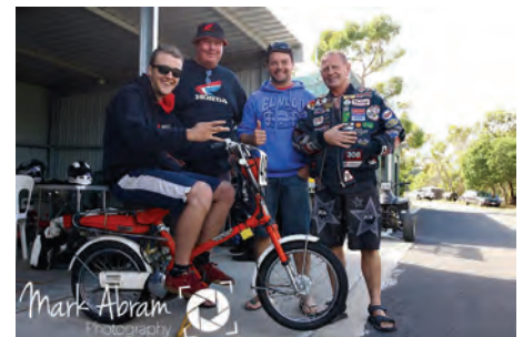
Best Presented - Red Rocket team