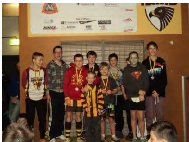
Round 12 Coaches Award winners