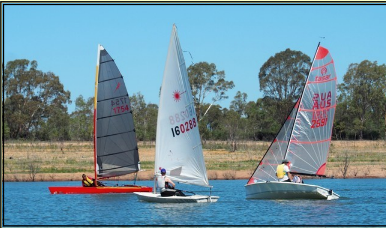
Kimbolton Series Race 5