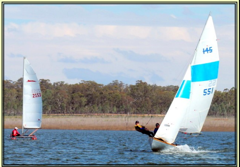
Kimbolton Series Race 16